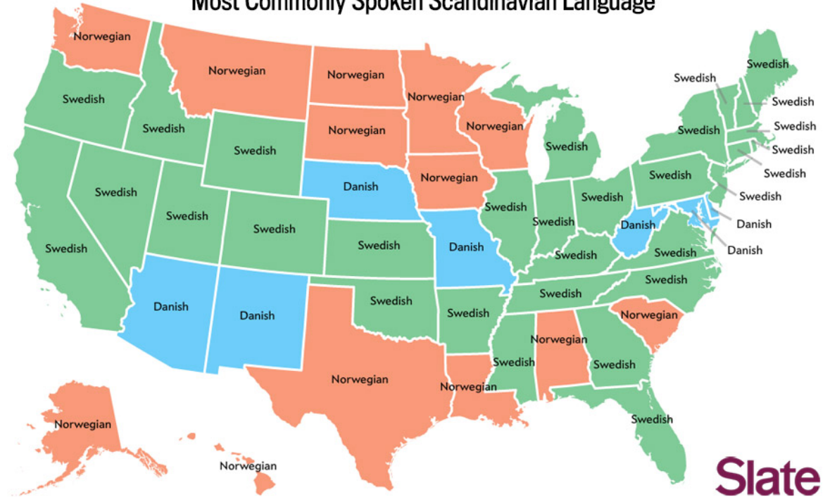
Data source: Census Bureau American Community Survey.

Next up, Indo-Aryan languages . For the purposes of this map, we consider Hindi, Gujarati, Urdu, Bengali, Panjabi, Marathi, Nepali, and Sinhalese to fall into that category.